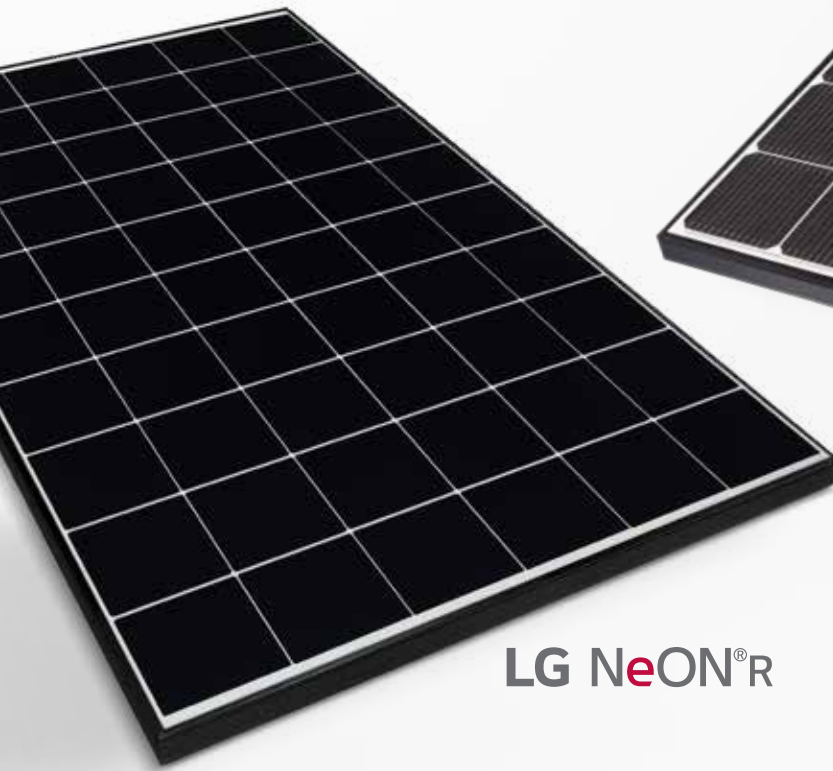
LG NeON ® R