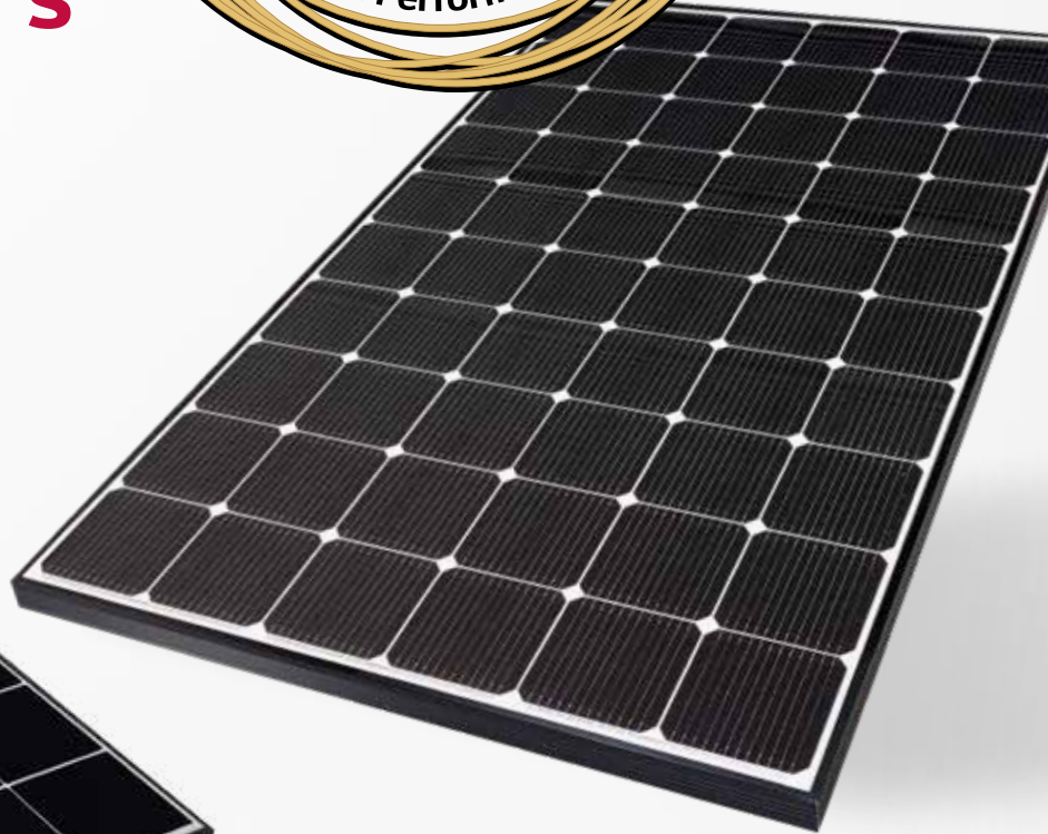
LG NeON ® 2